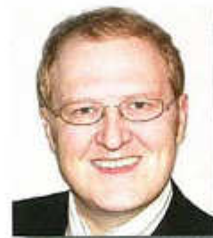
By Mariusz J.A. Sapijaszko,

TiteFx is a real unique addition to our treatment options for unwanted fat as well as bonus skin tightening. Its unique design is truly remarkable with built-in safety and effectiveness. Like all treatments that focus on fat reduction, it is important to also adhere to a healthy diet and engage in meaningful exercise. It is time to take control of your body shape and TiteFx is here to help. ■