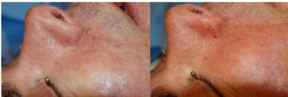
Figure 5 - Nasal spider vessels before and immediately after Fractora treatment