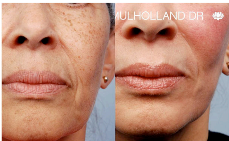
Figure 4 - Female patient before the treatment and 64 months after a single full face treatment